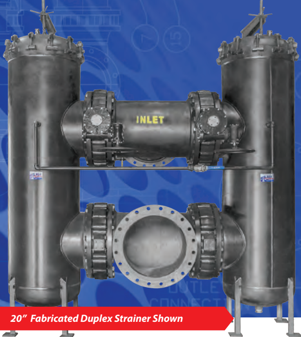
20" Fabricated Duplex Strainer Shown

Fabricated Duplex strainers are required when an off-the-shelf solution will not meet your exact piping requirements. All of our Fabricated Strainers are made right here in the USA, at our state-of-the-art facility in the southeastern part of North Carolina.