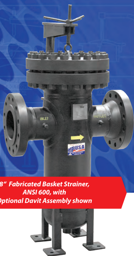
All pictures shown are for illustrative purposes only. Actual product may vary due to product enhancement.

8" Fabricated Basket Strainer, ANSI 600, with Optional Davit Assembly shown