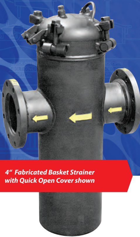
4" Fabricated Basket Strainer with Quick Open Cover shown

Fabricated Basket strainers are required when an off-the-shelf solution will not meet your exact piping requirements. All of our Fabricated Strainers are made right here in the USA, at our state-of-the-art facility in the southeastern part of North Carolina.