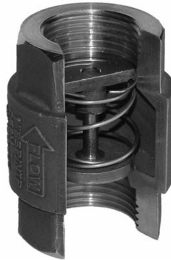
Figure 6: Stainless Threaded End Check Valve Internal Cutaway View (Old Style)

THIS WARRANTY IS IN LIEU OF ANY OTHER WARRANTIES, EXPRESS OR IMPLIED, INCLUDING ANY IMPLIED WARRANTY OF FITNESS OR MERCHANTABILITY. SELLER SHALL NOT BE LIABLE FOR ANY SPECIAL, INCIDENTAL, OR CONSEQUENTIAL DAMAGES. NO REPRESENTATIVE OR SELLER HAS AUTHORITY TO MAKE ANY REPRESENTATIONS OR WARRANTIES, EXCEPT AS STATED HEREIN.