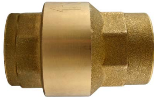
Figure 1: CV 20-BZ 1/4" ~ 2" 400 WOG • 2 1/2" ~ 4" WOG Brass Body • Buna-N Seat

Please contact a Titan Design Engineer to assist in the determination of these requirements prior to selection and purchase.