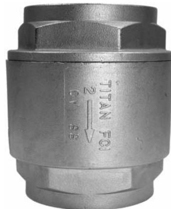
Figure 2: CV 80-SS ANSI Class 150/300 Stainless Steel Body • PTFE Seat