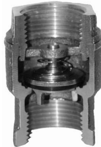
Figure 7: Bronze Threaded End Check Valve Internal Cutaway View (Old Style)